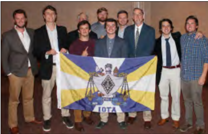
ZBT Iota 2017 fall class officers and advisors.