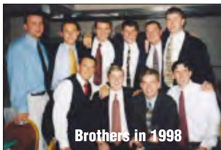
A man at 40.

http://fraternalthoughts.blogspot.com/2016/09/a-fraternity-life-at-forty.html