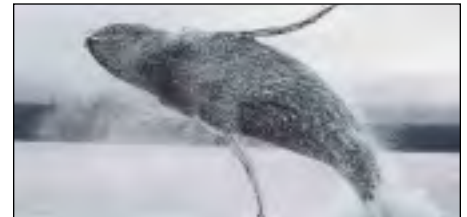
A breaching humpback whale entertained us for a half hour about a mile off shore.