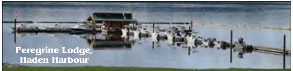
Peregrine Lodge, Haden Harbour