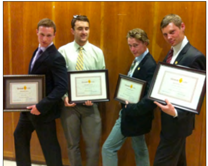
Congratulations to our Greek Award winning brothers.