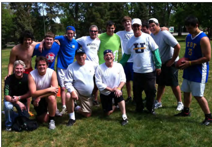
Annual spring Alumni/Undergrad football game was held on Sunday, May 6th at Observatory Park.