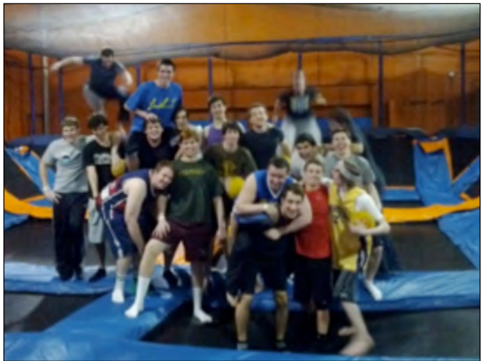
BDD at Jumpstreet Trampoline Park.