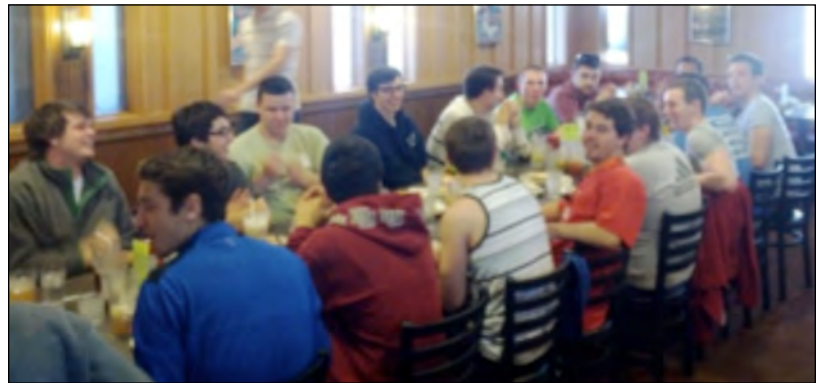
Good times and good food at The New York Deli.