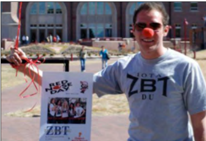
Supporting Children's Miracle Network one red nose at a time.