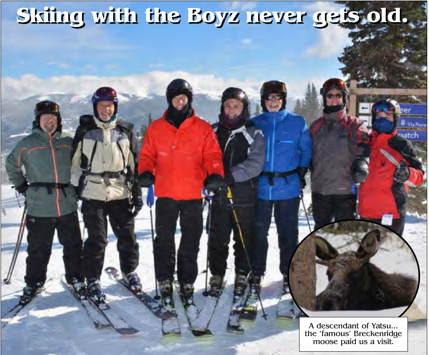
A descendant of Yatsu... the 'famous' Breckenridge moose paid us a visit.