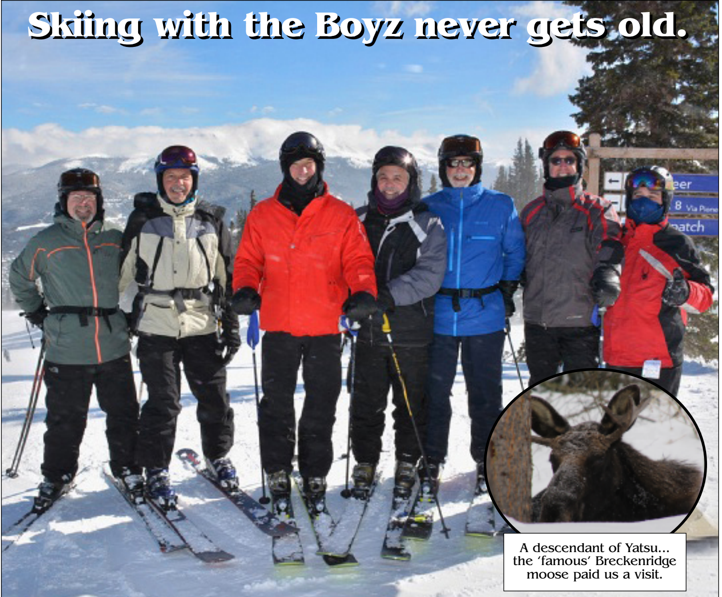
A descendant of Yatsu... the 'famous' Breckenridge moose paid us a visit.