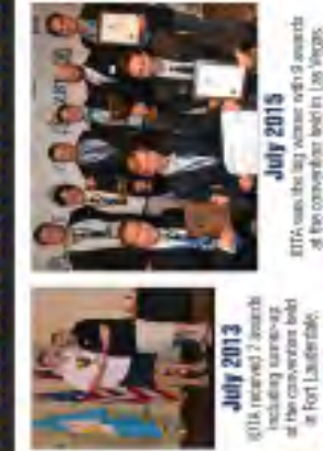
EITA was the lay winner outs 9 awards of the convention held in Los Vegas. July 2015