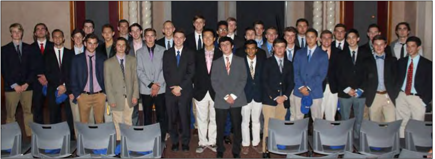
This fall we were proud to initiate 34 new members to our brotherhood.