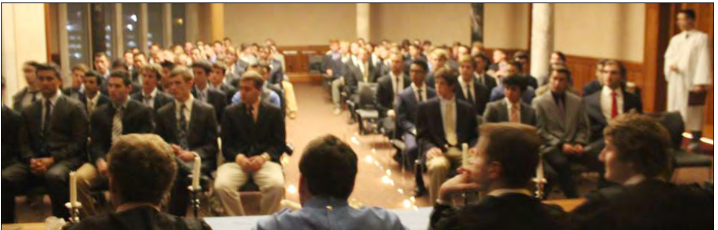
Brothers awaiting the start of the ritual.